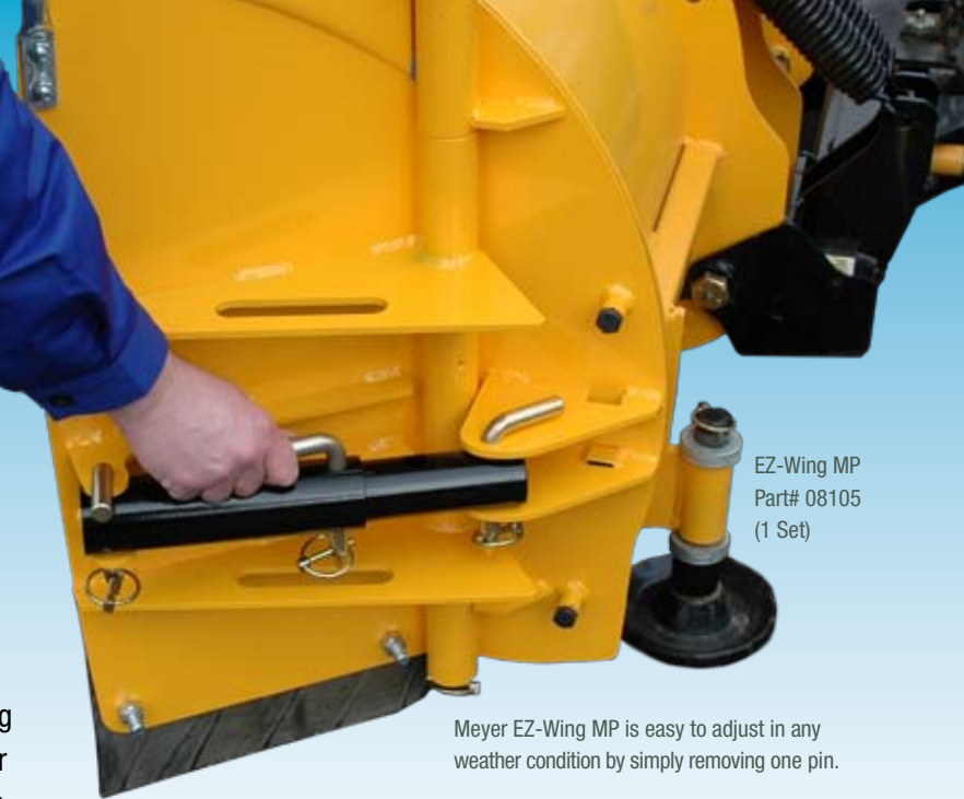
EZ-Wing MP Part# 08105 (1 Set)

Meyer EZ-Wing MP is easy to adjust in any weather condition by simply removing one pin.