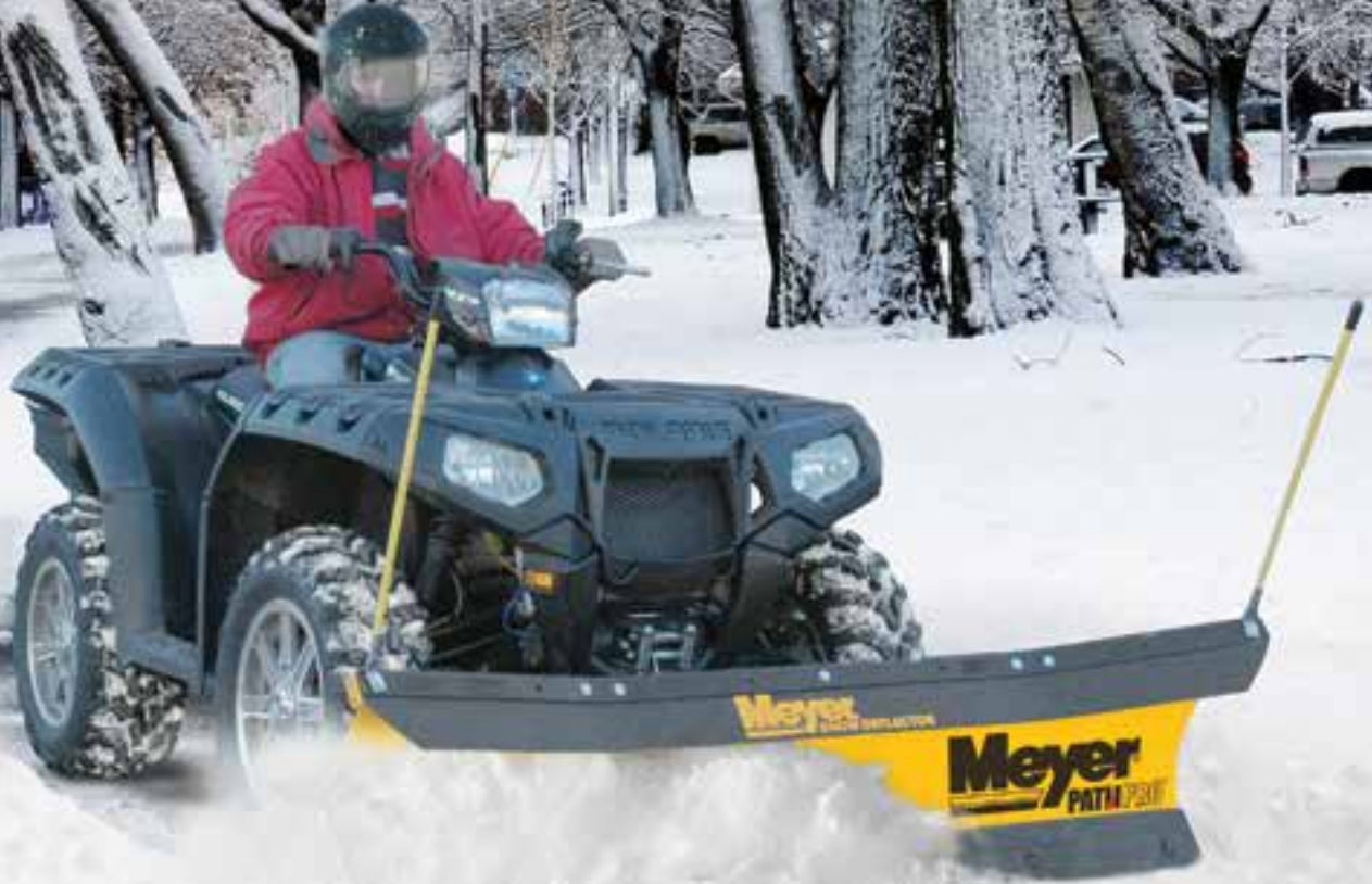
Path Pro shown with optional deflector and plow markers.