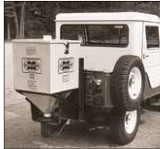
In 1972 the Meyer "Mini Spreader" was introduced. The perfect size to control ice where the big trucks couldn't.