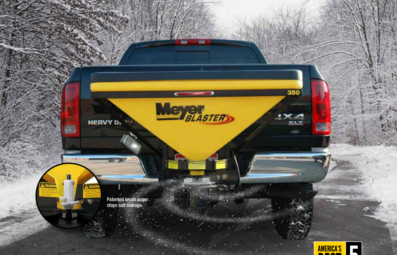
Patented brush auger stops salt leakage.