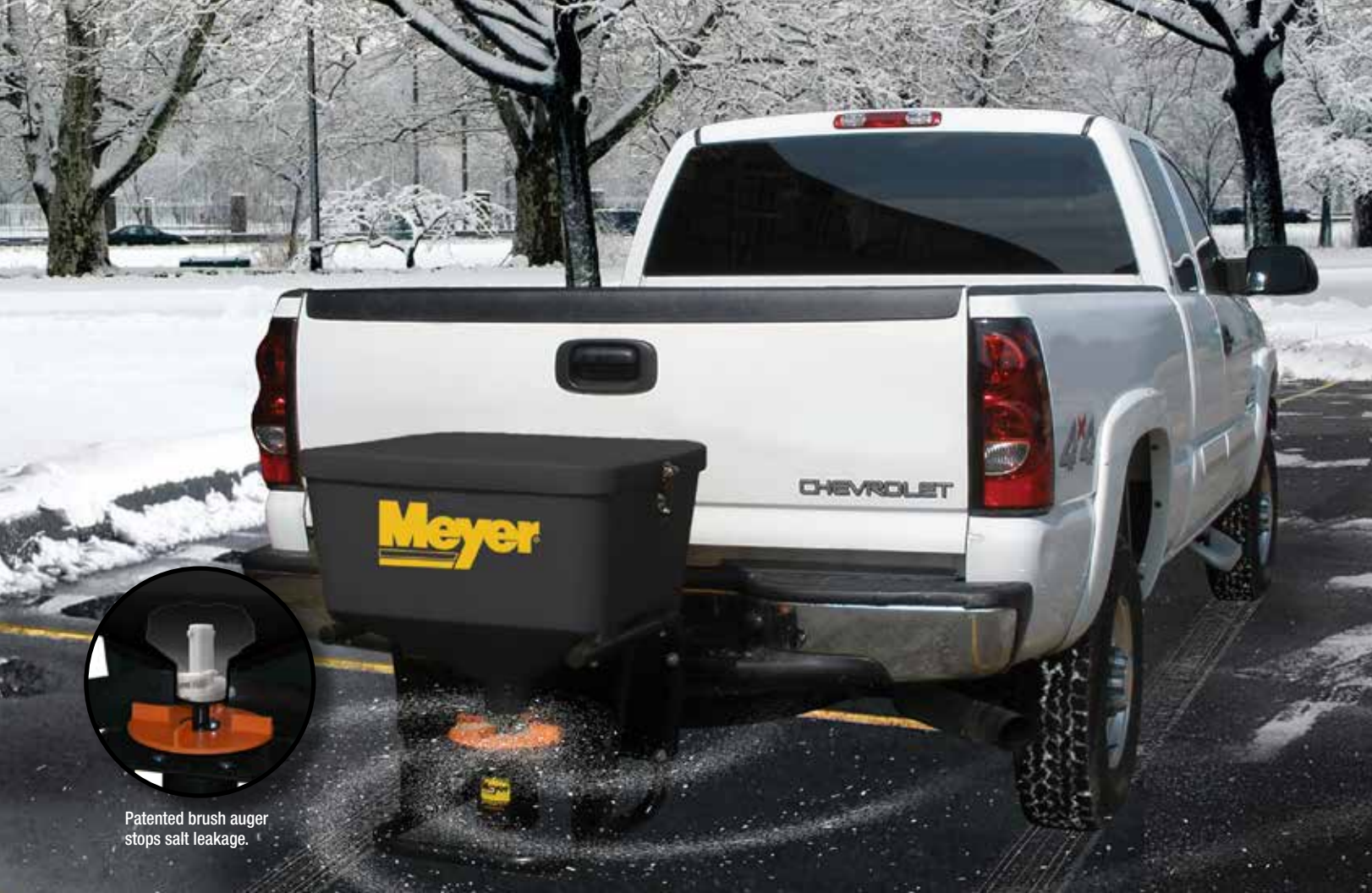
Patented brush auger stops salt leakage.