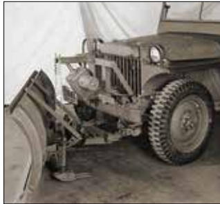
Designed the first plow for 4-wheel drive vehicles.