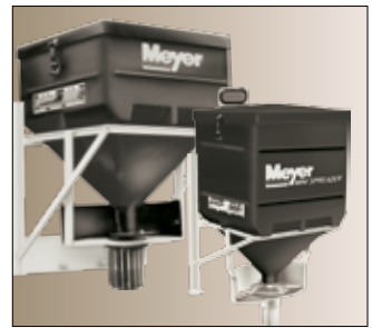
In 1999 black thermoplastic replaced fiberglass on the hopper.