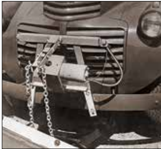
Developed the T-1 Electric Hydraulic Lift, the first ever.