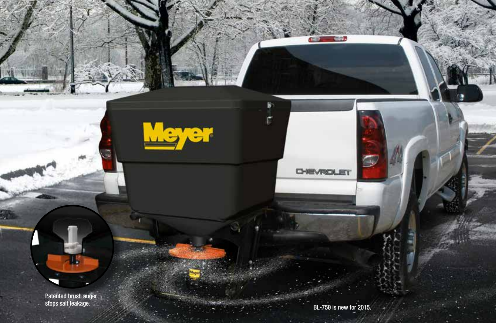
Patented brush auger stops salt leakage.