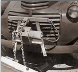
Developed the T-1 Electric Hydraulic Lift, the first ever.