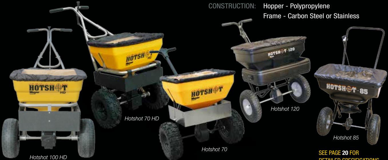
Hotshot 100 HD