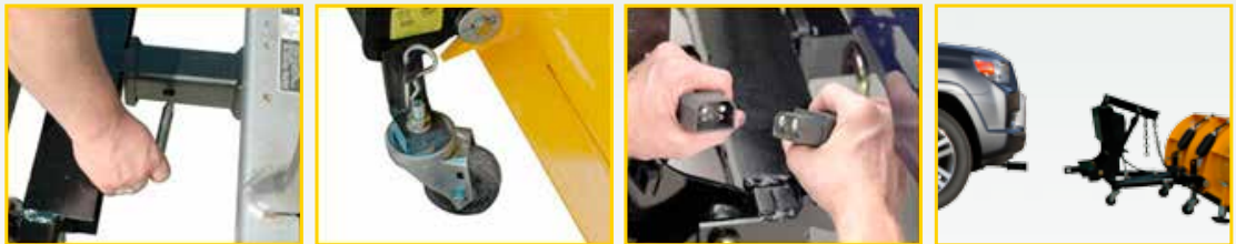
Step 1: Insert or remove the pin

comes on/off the vehicle in seconds by removing one pin.