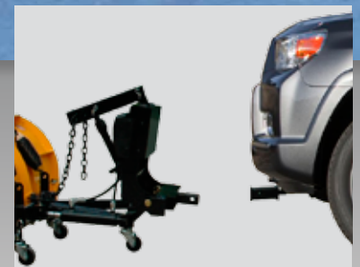
Meyer's EZ-Mount Receiver Hitch Plow allows you to remove or mount the plow in seconds.

The EZ-Mount Receiver Hitch Plow is the perfect solution when unexpected storms arrive and you need to clear snow from your driveway. The easy-to-use plow features Meyer's 5cm (2"), Class 3 front receiver mount and is available in three moldboard sizes – 1,52m (5'), 1,82m (6'), 2,03m (6'8") and 2,29m (7'6") – to suit your application. Available in power or self-angling models.