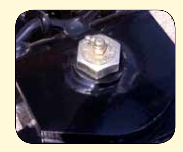
All pivot points have easy-to-reach grease fittings in key locations to increase service life.