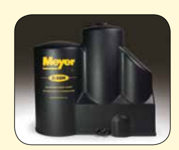
All-new custom molded hydraulic cover for E-58H units is standard. Protects from salt and road grime for improved reliability.

Behind the moldboard is totally redesigned "black iron" consisting of a robust, tubular-steel A-frame and pivot bar. This improved design has been simplified to create a stronger plow at key pressure zones and more evenly distributes the load. The pressure zones are further enhanced by three, reinforced points-of-contact and a tubular bar along the entire back for increased torsional strength. The Lot Pro also comes with easy-to-reach grease fittings in key locations like the heavy-duty king bolt.