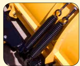
Heavy-duty trip springs last 2 to 3 times longer than the competition and are part of Meyer's ROC manufacturing process.