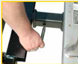
Step 1: Insert or remove the pin

comes on/off the vehicle in seconds by removing one pin.