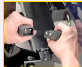
Step 3: Connect/disconnect power plug