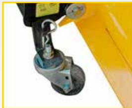
Step 2: Position the wheels