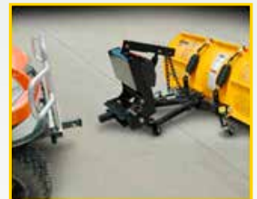
Step 4: Roll the plow away from vehicle