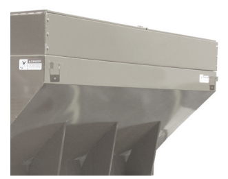
Side Extensions – Optional side extensions quickly increase hopper capacity.

*All gas models are standard with wireless control. Wireless control is not available with dual motor electric or hydraulic models. Dual electric is hardwired only. **Available on gas engine models only.