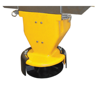
Spinner Chute – Forward handles and pins for easy on/off.

The wireless controller remotely allows the gas engine speed to throttle up, down and choke as well as turn on and off.