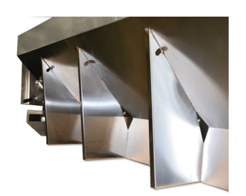
Hopper – Lighter hopper available in carbon steel or maintenance-free stainless steel

Conveyor options include drag chain or belt-over-chain that delivers a consistent output of material, while not leaking into the hopper.