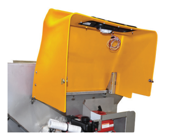
Gas Springs** – The gas springs hold the engine shroud in the open position during refueling and maintenance.

To make the Meyer ELITE spreaders more versatile, the following optional equipment is available: tarp kit, side extensions, vibrator kit and tie-down kit.