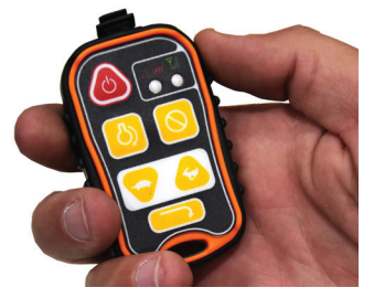
Wireless Controller – Control the engine speed using touchpad buttons.