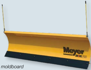
Drive Pro moldboard