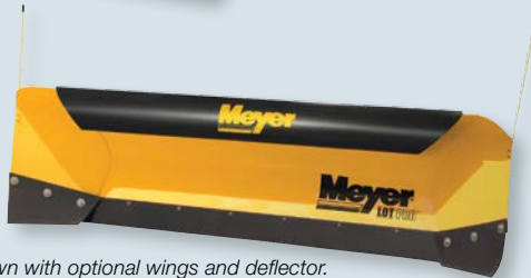
Lot Pro shown with optional wings and deflector.