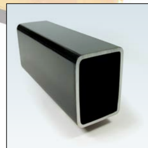
The pivot bar is constructed using heavy walled tubular steel for added strength and rigidity.