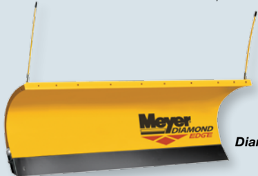
Diamond Edge bottom-trip moldboard