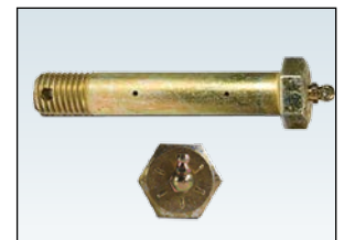
Pro Series plows utilize a larger king bolt that is 41% stronger and can withstand a load 2.4 times greater. Features easy-to-reach grease fitting for longer service life.

All Pro Series moldboards feature increased height and aggressive attack angles for excellent plowing performance.