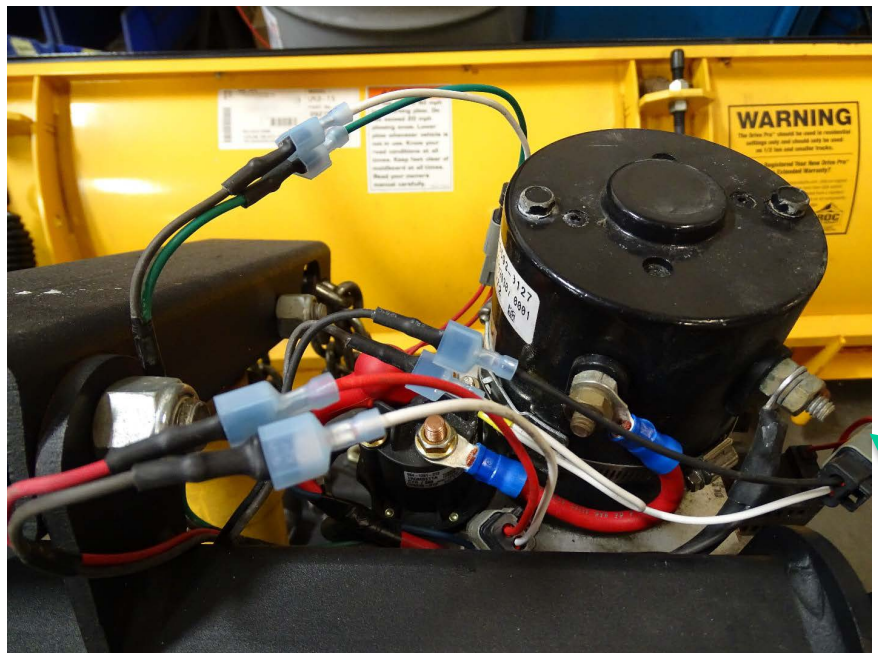
Step 6: Connect White wire loop to the small terminal nearest the hydraulic motor (A), the brown wire loop to the small terminal farthest from the hydraulic motor (B). Connect the heavy red wire to the large terminal of the motor solenoid (C).