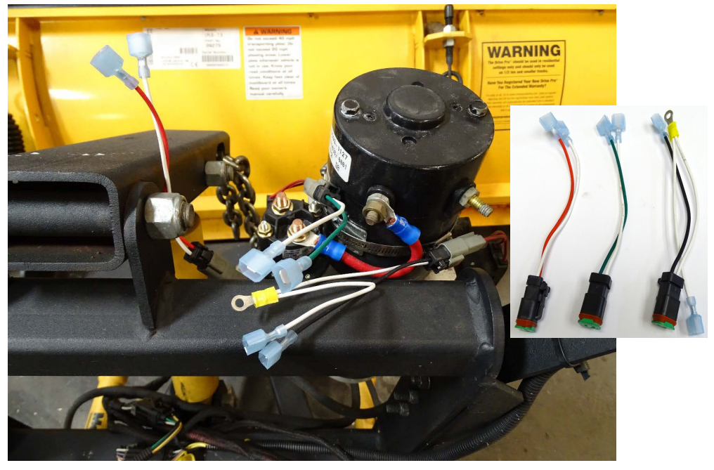
Step 5: Connect the three coil adapters (7) (red, green and black) to the Harness (4) (brown to white, red to red, black to black and green to green). Connect the heavy black wire to the motor ground as shown (A). If motor does not have a ground lug connect heavy black wire to the Hydraulic Block.